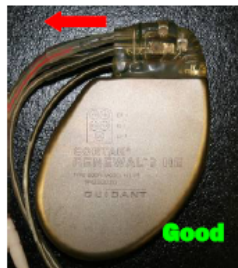
Figure 1. Optimal orientation for subpectoral implants. Leads exit in a counter clockwise direction. Serial number is facing away from the ribs.

Accelerated life testing has shown that repetitive mechanical stress applied to the serial number side of the titanium case can induce component damage and device malfunction. This has occurred only when the device was implanted subpectorally with the serial number facing the ribs (Figure 2).